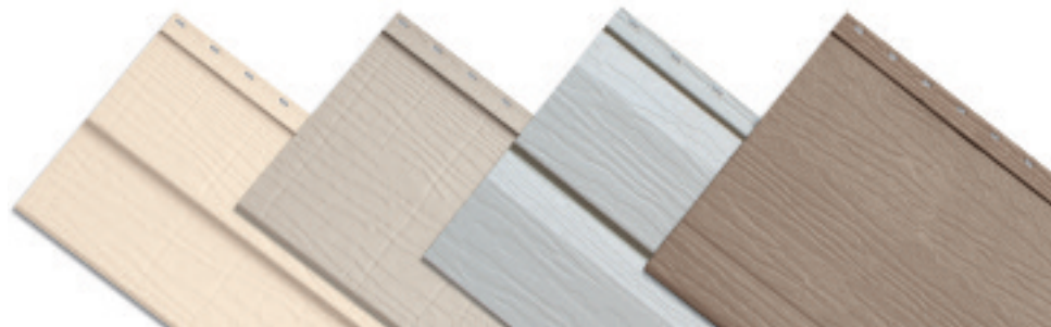
12" Vertical Board & Batten Medium Woodgrain Texture