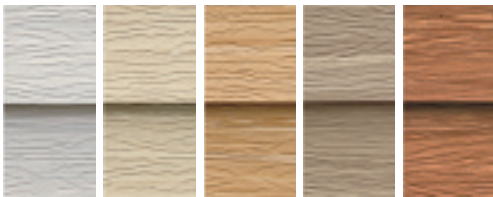
Aspen Gray Tawny Oak Maple Tan Chestnut Brown Coastal Redwood

When only the best will do. A natural beauty, with luxurious coloring and a rich woodgrain texture. A rugged steel construction, carefully contoured and wrapped in a resilient finish. A statement of style for those who want an exquisite home exterior. Welcome to Cedarwood steel siding.